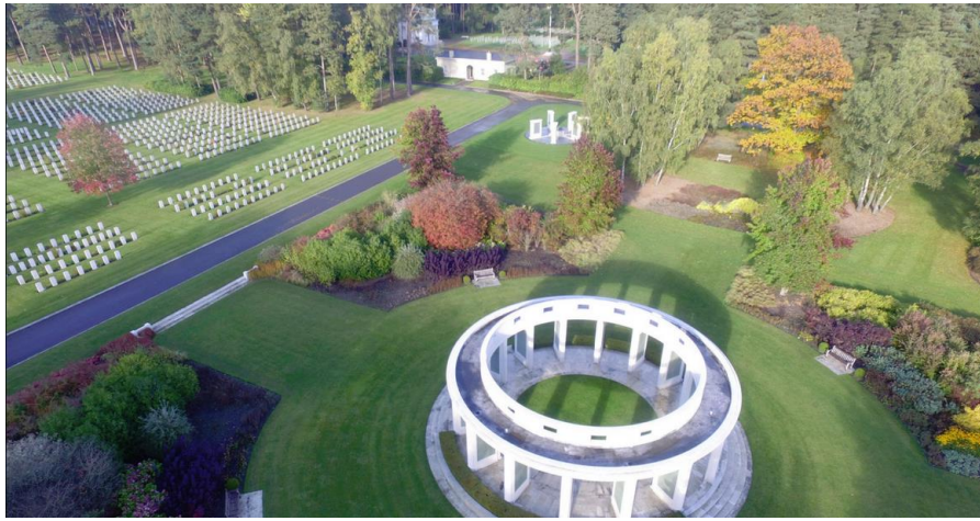
Brookwood Military Cemetery